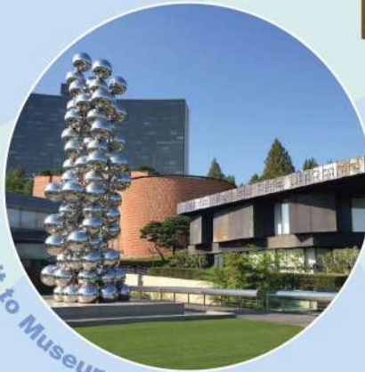
Visit to Museum