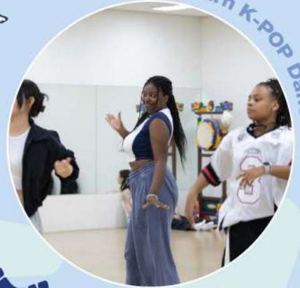
Learn K-POP Dance