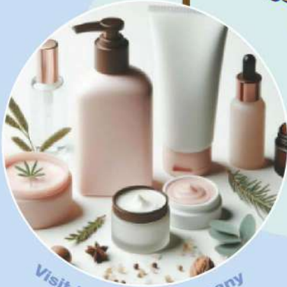
Visit to Korean Company