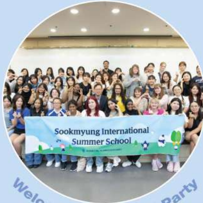
Welcome & Farewell Party