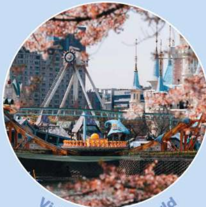
Visit to Lotte World