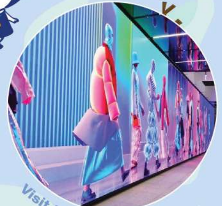
Visit to Hikr Ground