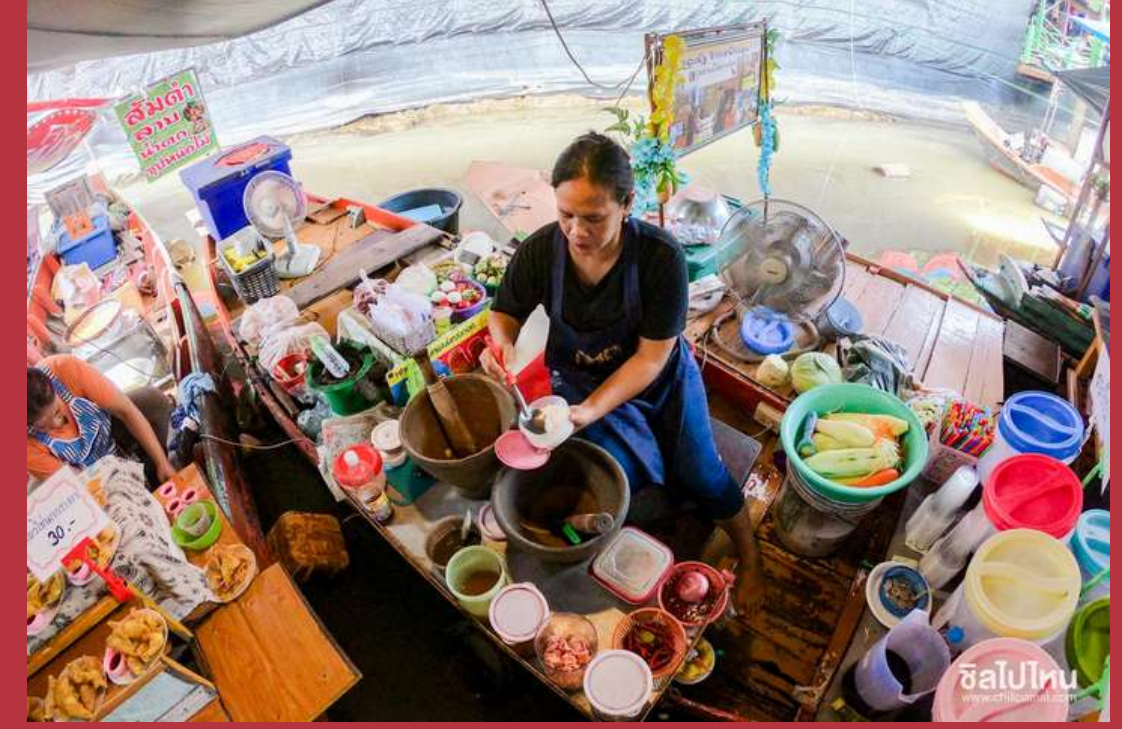
AYOTHAYA FLOATING MARKET